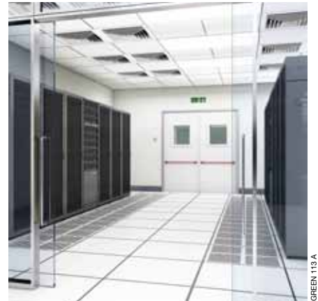
GREEN 113 A