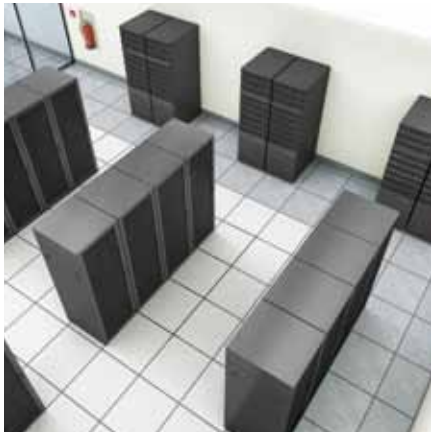
GREEN 115 A

Companies running high-performance computing systems or critical automated processes need solutions that match their application requirements. The constant changes involved means that data center, IT and facility managers face a complex balancing act: maximizing availability, keeping costs down and maintaining a flexible infrastructure.