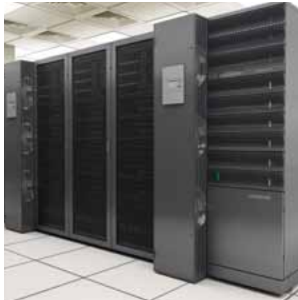
GREEN 114 A